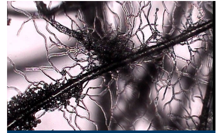
Untreated (Filter Fibres)